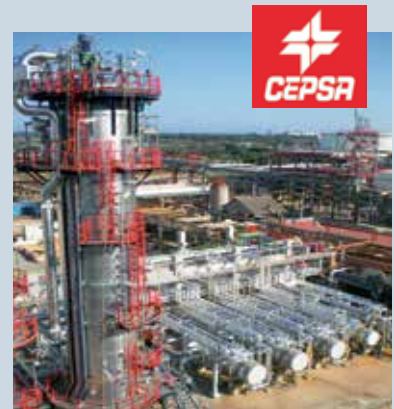
Biturox® Bitumen Plant for CEPSA La Rabida, Spain

Commissioning was completed in August, 2011 after a design phase of 15 months and an erection period of 12 months.