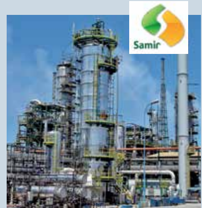
Biturox® Bitumen Unit for SAMIR Mohammedia, Morocco

Pörner provided license, support at financing and executed the project management, basic and detail engineering, supply of equipment and erection on-site up to commissioning and start-up of the plant within a time period of 22 months.