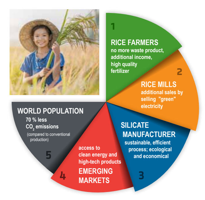
All parties involved in the value creation process benifit from the Pörner technologie

Pörner Group is offering revolutionary process technology for clients wanting to create a smarter, cleaner world while also enjoying quite significant financial benefits. The proprietary technology includes clean power generation from rice hulls, high purity silicate production from the ash, and downstream production of high purity silica materials. Projects executed with precision German engineering from the process experts in Grimma.