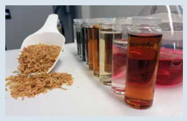
Several sodium- and potassium silicates, ash and carbon absorbent suspensions

Clients may ship quantities of ash for testing or Pörner Group can provide a standardized ash under signed agreements for testing and limited production of pure liquid silicates. Additional laboratory and prototype equipment are located within the building for a timely analytical support. We provide you with real-world proof of process.