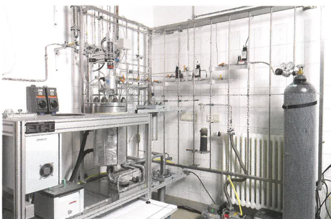
FIG. 2. Pilot plant in Leipzig, Germany, with autoclaves for under-critical and overcritical conditions.

refinery residues—a vacuum residue (VR) and a visbreaker tar (VT) from the SDA—are compared with the required criteria.