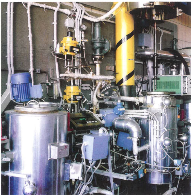
FIG. 5. Bitumen pilot plant in Vienna, Austria.

pable pitch can be produced. Finally, the decision to incorporate this combined residue technology depends on the compliance with required criteria both for the DAO and the pitch.