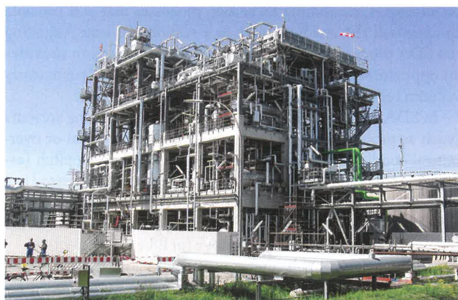
FIG. 4. A propane deasphalting plant at H&R Ölwerke Schindler in Hamburg, Germany.